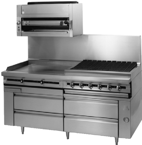
JMRH-36GT with range match broiler, remote refrigerator base, and range mount salamander